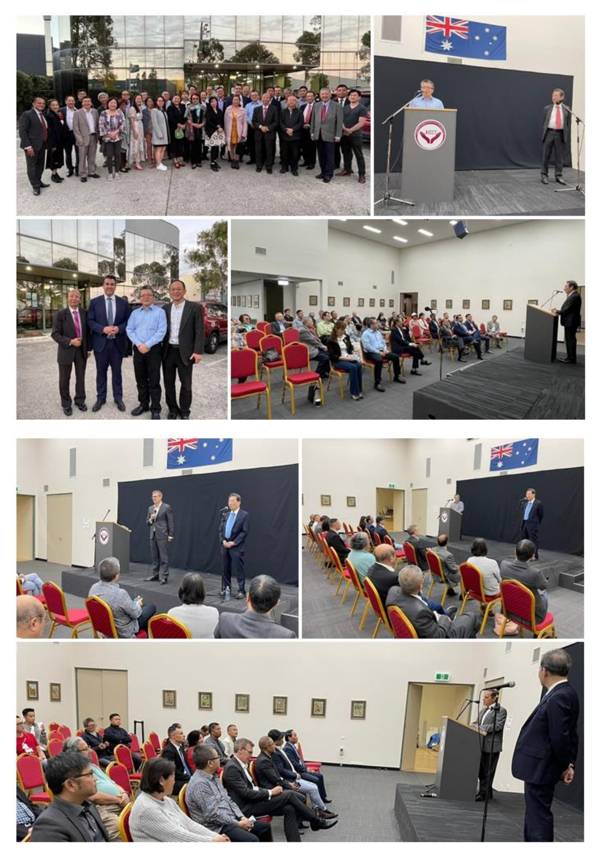
CAV Bulletin – June 2022

The topics of discussions included issues and concerns from the Chinese community. A lot of feedback and important issues were brought up to both MPs.