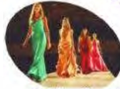
Fashion Parade by Melissa M Boutique