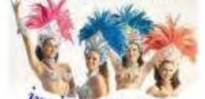
invites you to Rio de Janeiro Carnival

DATE : SATURDAY, 25th JUNE 2011 TIME : 6.30pm COST : $50.00 pp DRESS CODE : Smart Casual