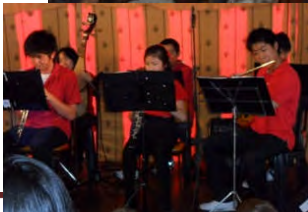
School Orchestra at Knox Festival