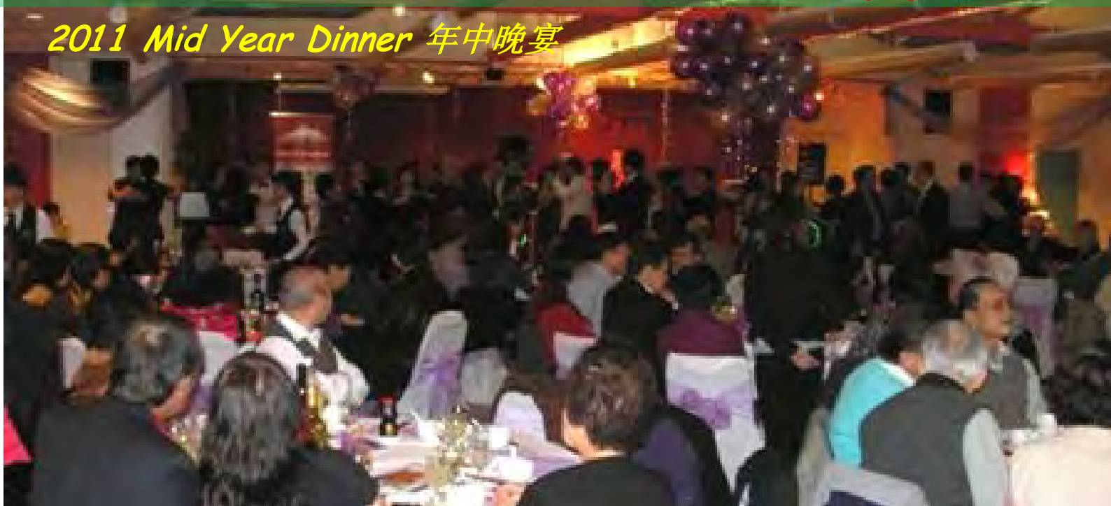
2011 Mid Year Dinner 年中晚宴